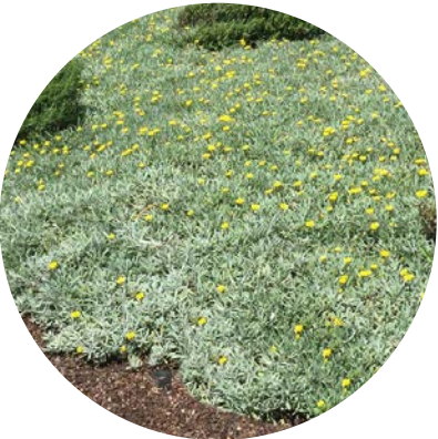
Gazania tomentosa Gazania