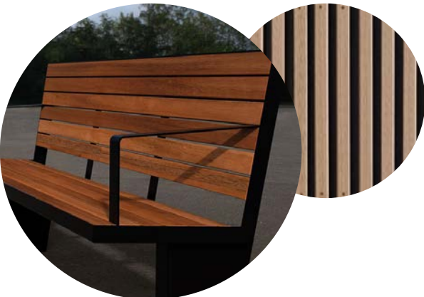
Enviroslat bench seating to match stage 3