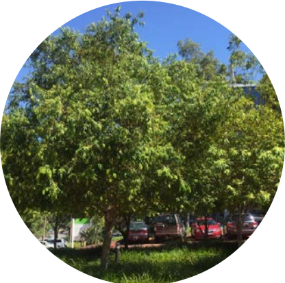
Tree and understory planting to islands