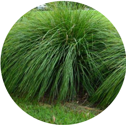
Low grass and groundcover planting