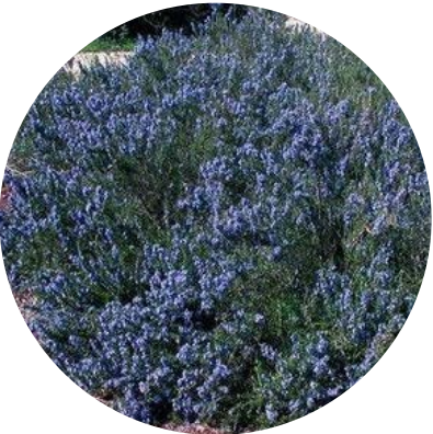
Rosmarinus officinalis 'Blue Lagoon' Rosemary