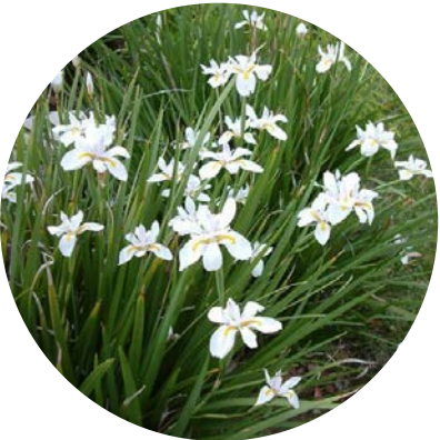
Dietes iridoides Wild Iris