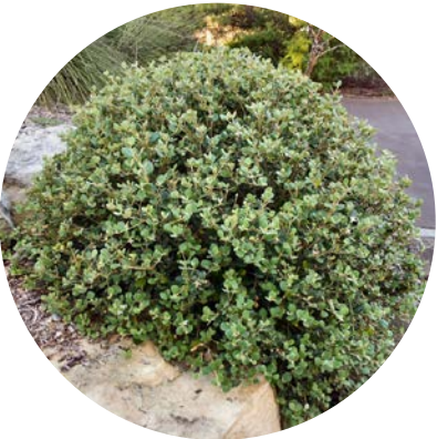
Correa alba White Correa