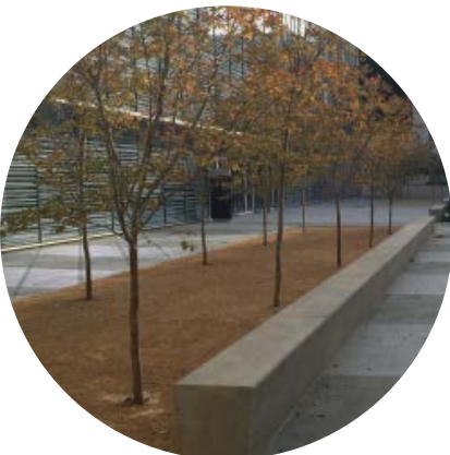
Grove of trees in Deco granite