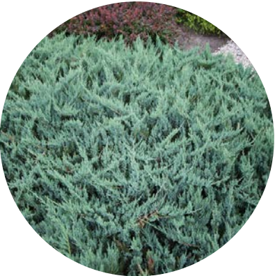
Juniperus horizontalis 'Douglasii' Prostrate Juniper