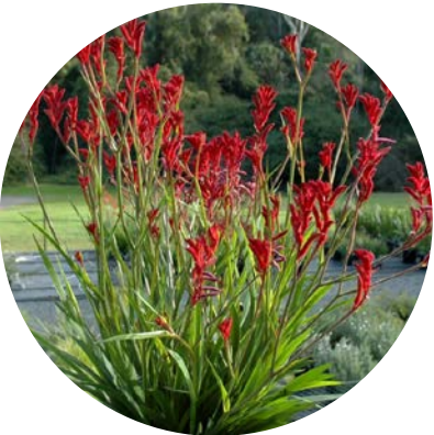
Anigozanthos 'Bush Gem' Kangaroo Paw