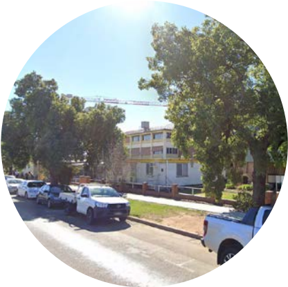
Docker Street Trees to be retained