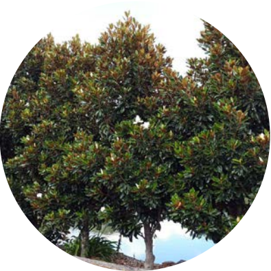
Magnolia grandiflora 'Little Gem' Magnolia Little Gem