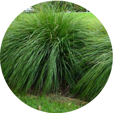
Lomandra longifolia 'Tanika' Dwarf Mat Rush