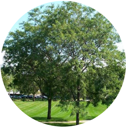
Tree Planting to match northern carpark