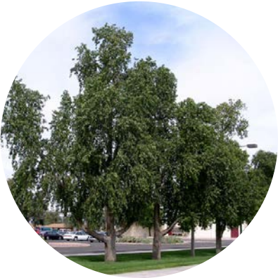
Brachychiton populneus Kurrajong