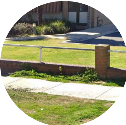
Existing Docker Street fence to be retained with boundary shrub and groundcover planting