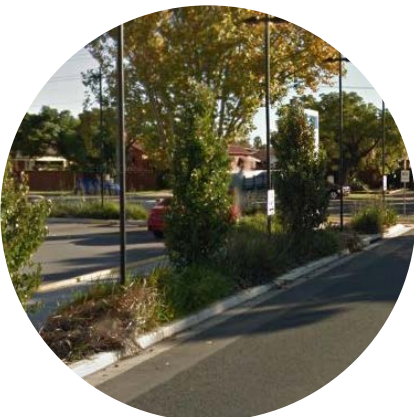
Lewis Drive Tree planting to match existing Pyrus species