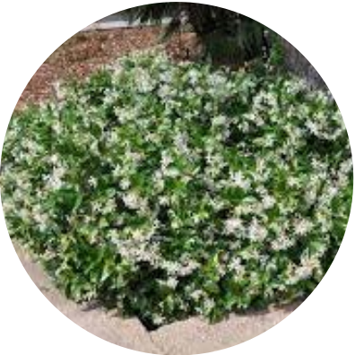
Trachelospermum jasminoides Star Jasmine