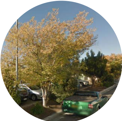
Lewis Drive Tree planting to match existing