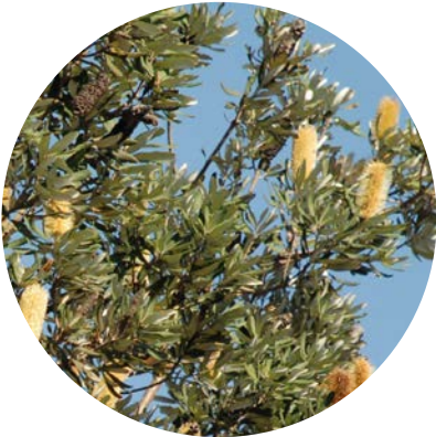
Banksia integrifolia Coast Banksia