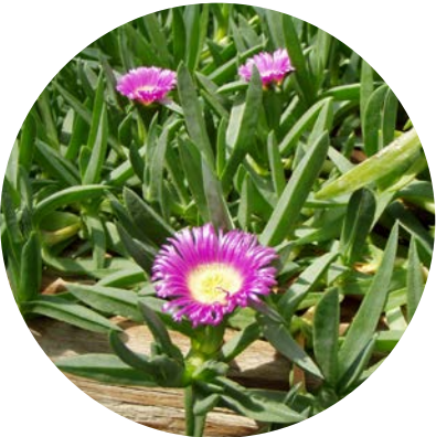
Carpobrotus glaucescens Pigface