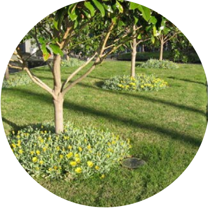
Lawn with tree planting to southern boundary