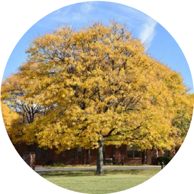
Gleditsia triacanthos 'Shademaster' Honey Locust