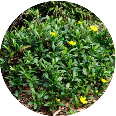
Hibbertia scandens Golden Guinea Vine