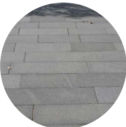
Forecourt paving to match stage 3 natural stone paving on colonnade to main pedestrian entry