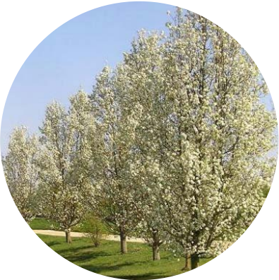
Pyrus calleryana 'Chanticleer' Callery Pear