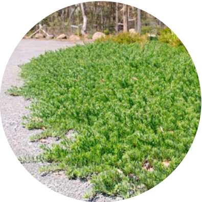
Myoporum parvifolium Creeping Boobialla